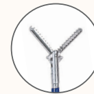
Alligator Grasper Forceps