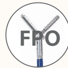
Disposable Retrieval Snare