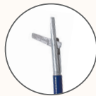
Single Action Scissors