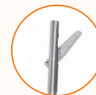
Scissors Single Action